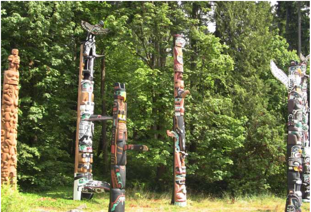
Totem Poles on the campus of the University of British Columbia