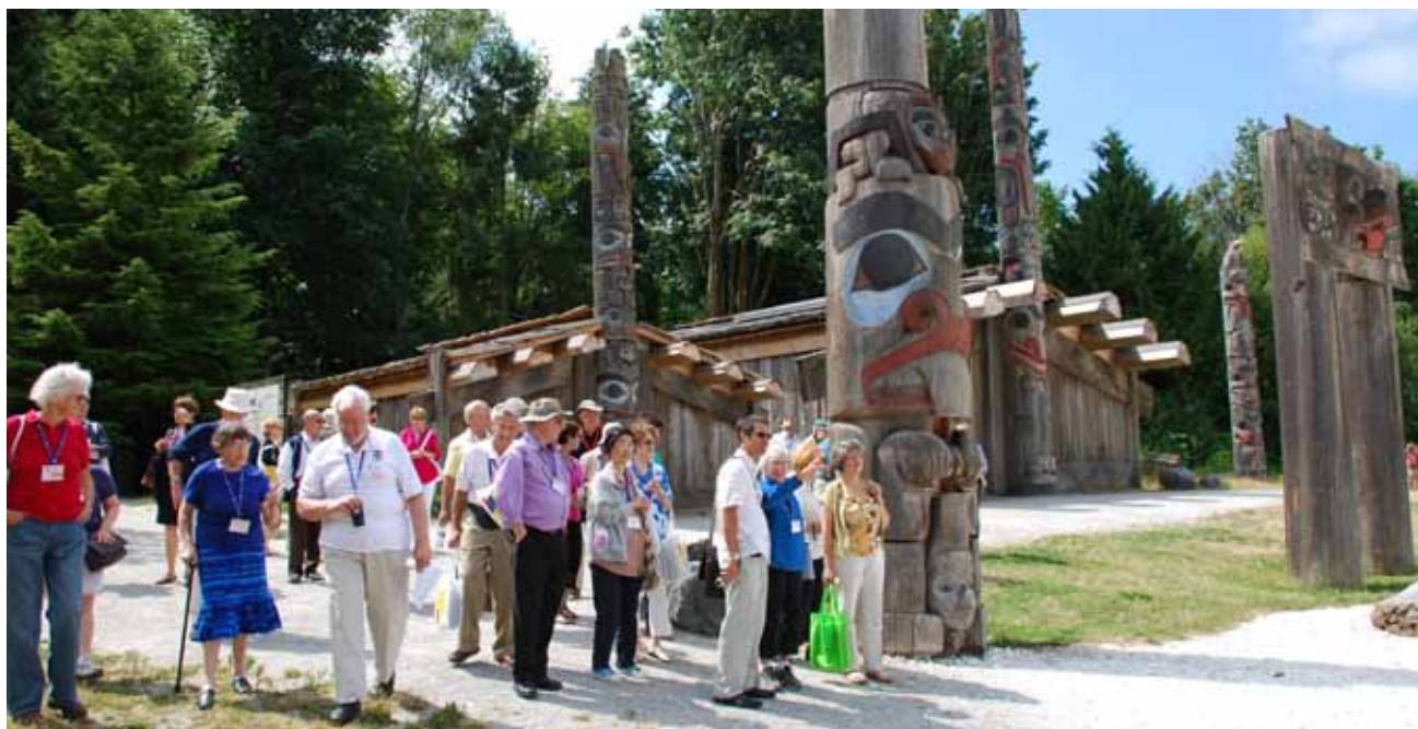
SUGUNA group at the Totem Poles and Haida Houses on UBC campus

We were extremely fortunate to take part in a walking tour of the University of British Columbia (UBC) campus led by renowned Canadian landscape architect, Cornelia Oberlander, and featuring the landscaping she designed for the C.K. Choi Building and the Museum of Anthropology.