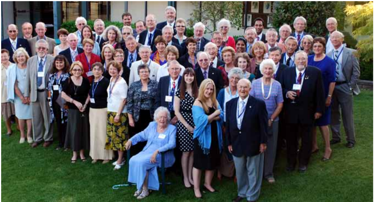
The SUGUNA Group

spectacularly laden banquet table, each meal seeming more delicious than the last.