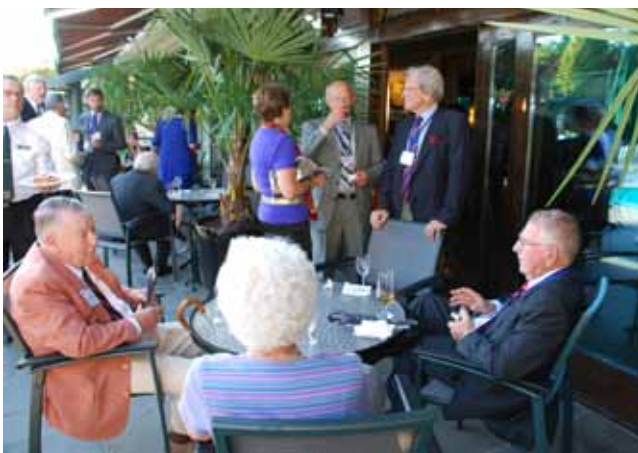
On the patio of the Vancouver Lawn Tennis and Badminton Club before the banquet