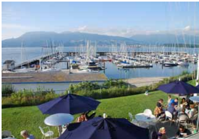
Royal Vancouver Yacht Club