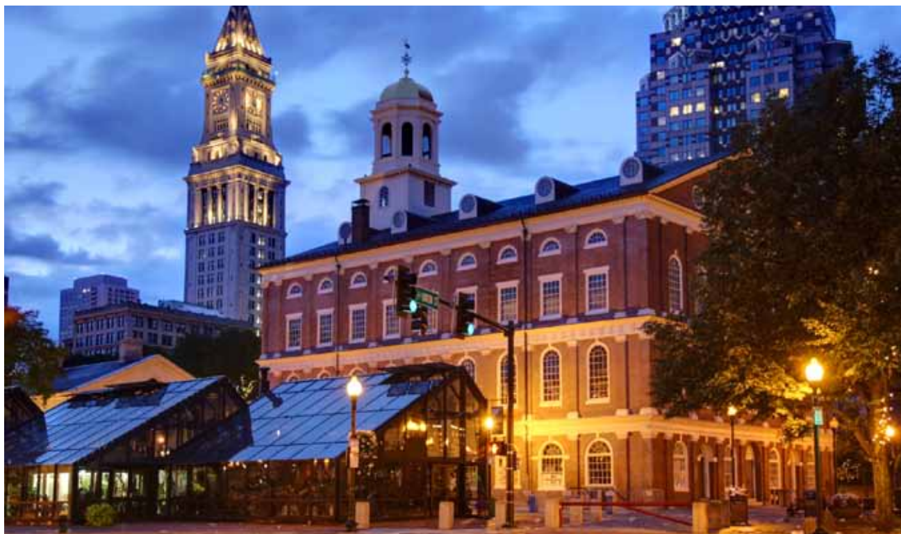
Faneuil Hall, Boston

The venue for SUGUNA's Annual Conference for 2012 will be at Boston University. The dates are August 2 – 5; mark them in your diary now, and if you haven't been to a Sydney University alumni event in the Americas before, make this the one. There will be plenty to do, much to listen to and many new people to meet over a stimulating and fun-filled few days. Bring the family; there will be something for everyone.